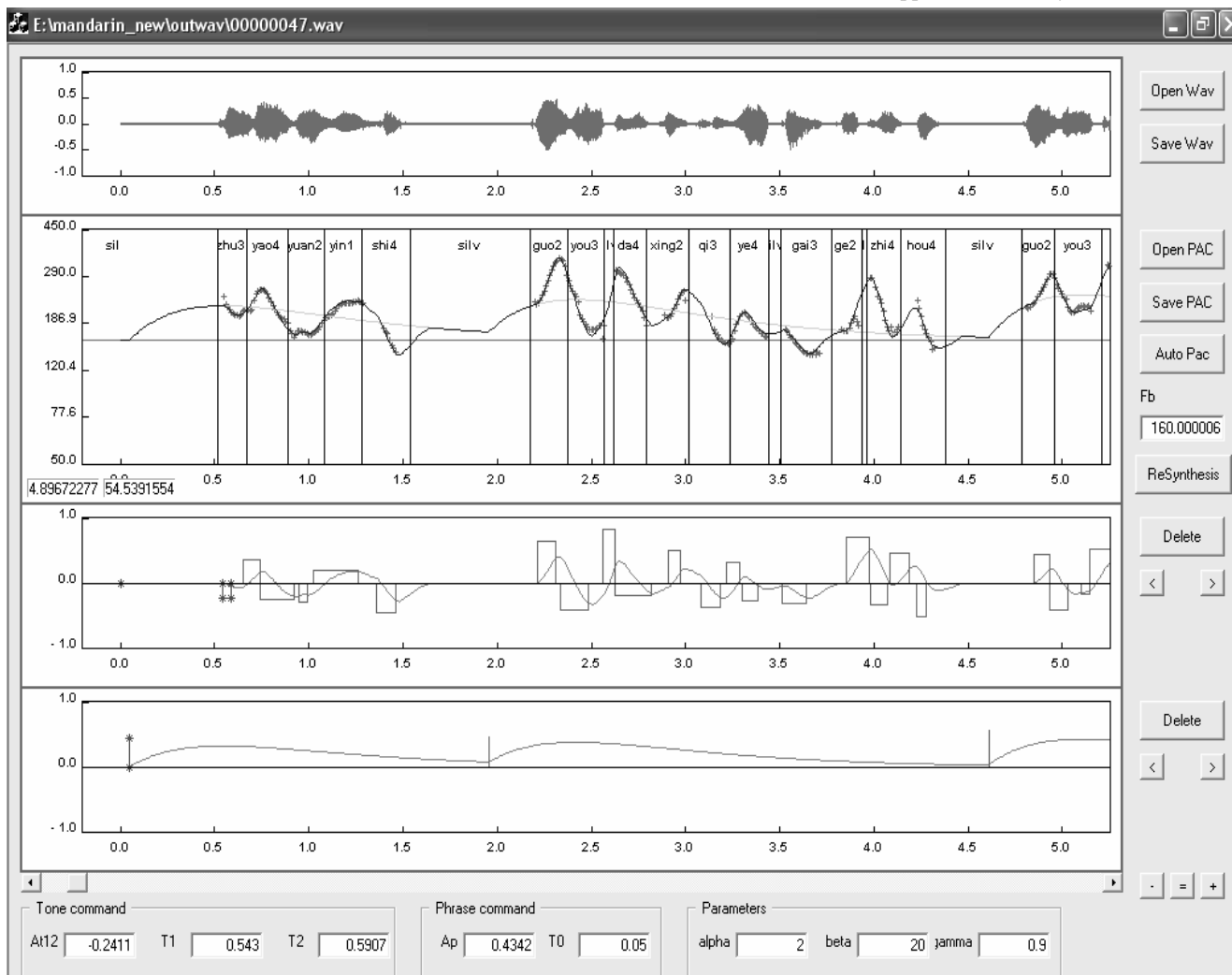
Figure 2. Resulting parameter configuration as displayed in the FujiParaEditor . From top to bottom: Speech waveform, F_0 contour, tone commands and resulting tone component, and phrase commands and resulting phrase component. The FujiParaEditor features real-time resynthesis based on Fujisaki model contour and integrated PSOLA automatic extraction ('Auto Pac').